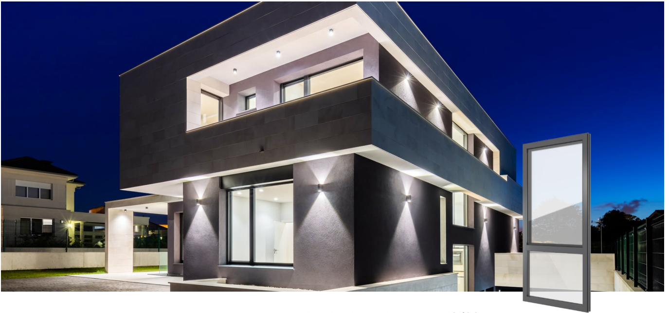
FIN-Project Nova-line 78/88 aluminium-aluminium