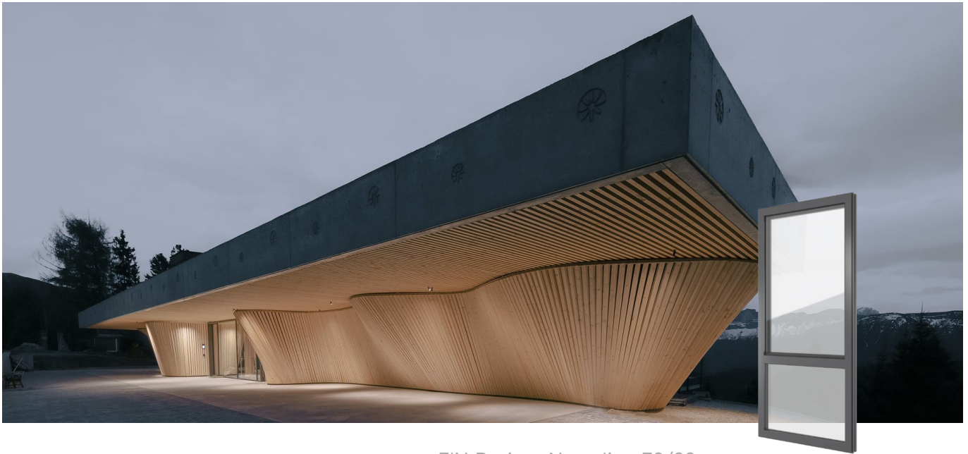
FIN-Project Nova-line 78/88 aluminium-aluminium