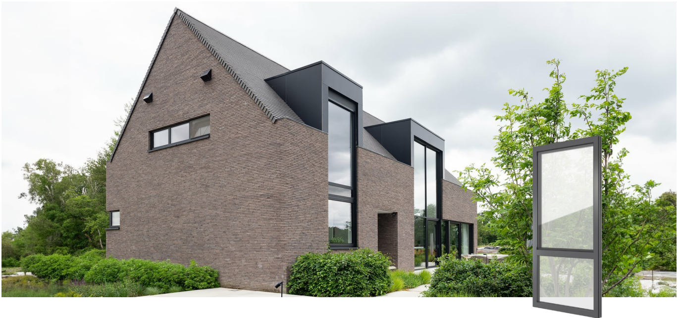
FIN-Project Nova-line 78/88 aluminium-aluminium