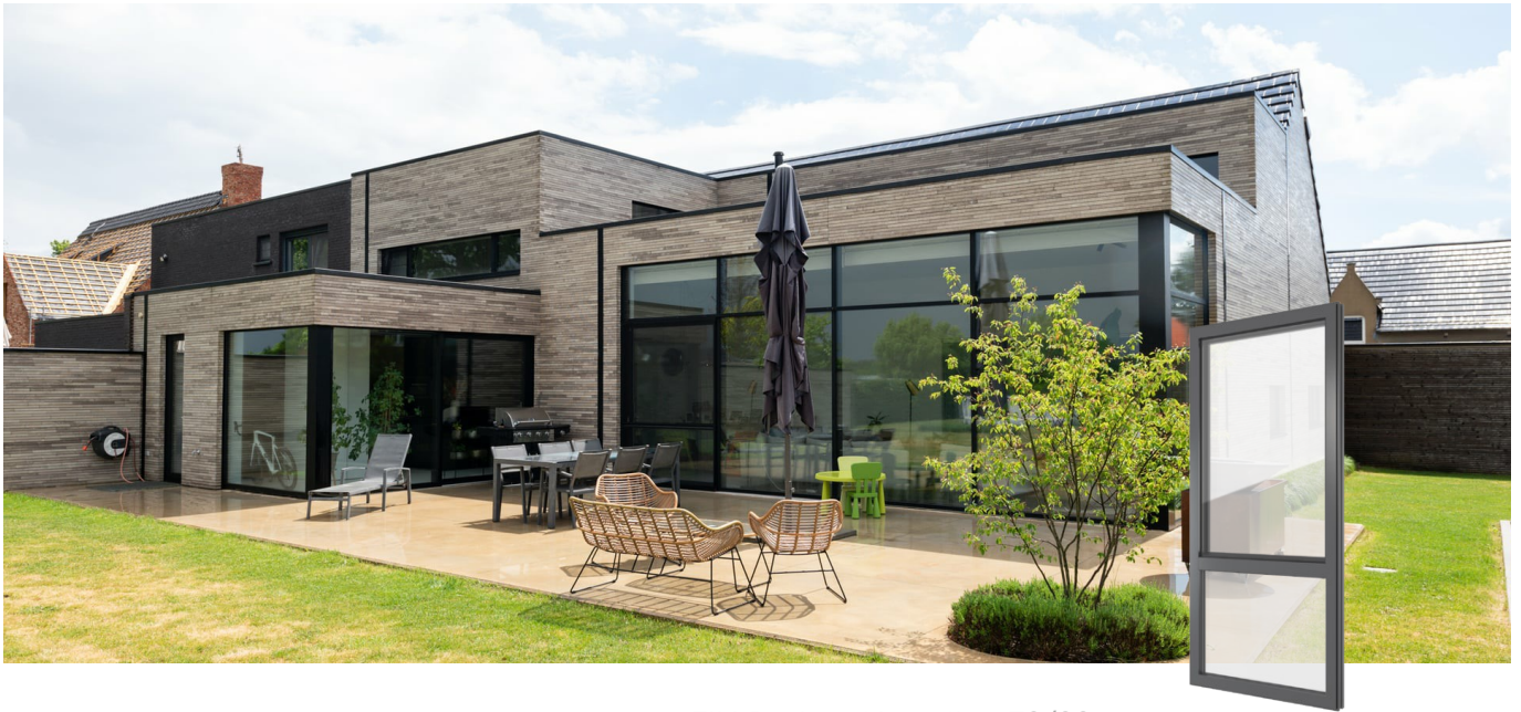
FIN-Project Nova-line 78/88 aluminium-aluminium