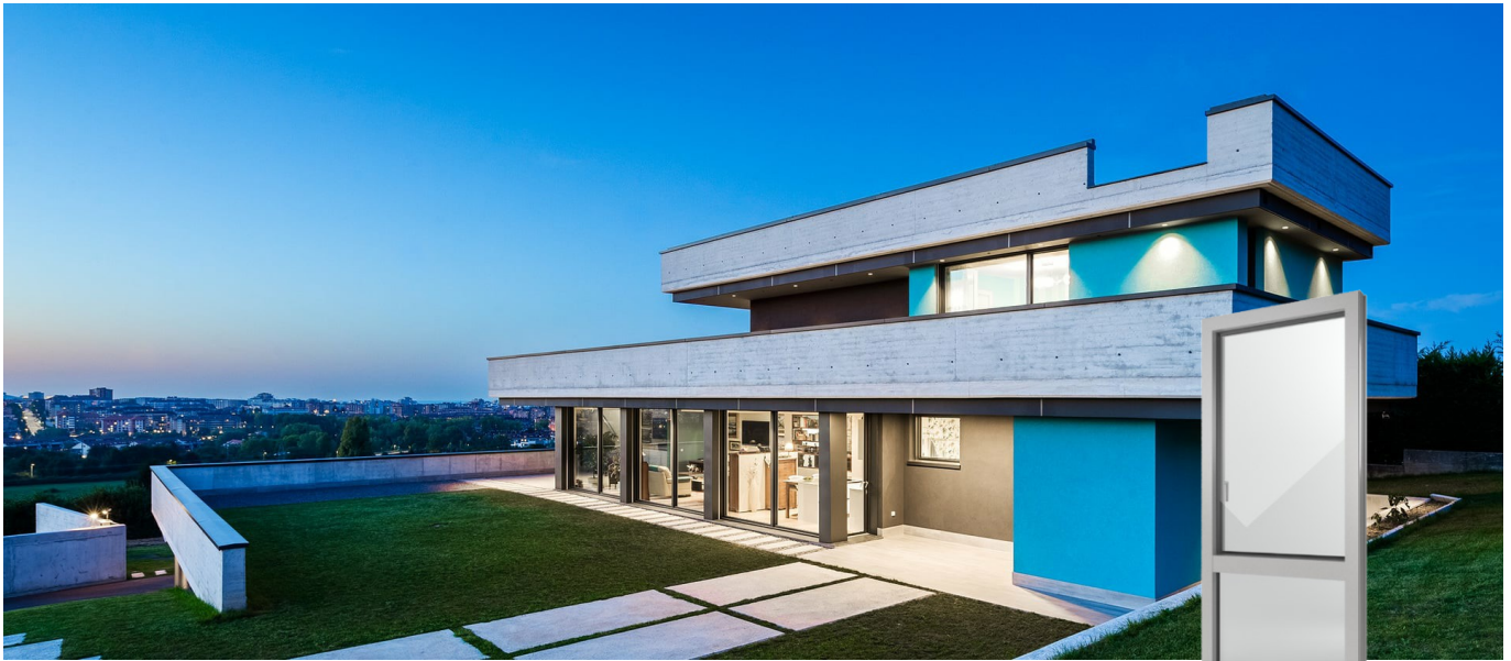
FIN-Window Nova-line N 90+8 aluminium-PVC